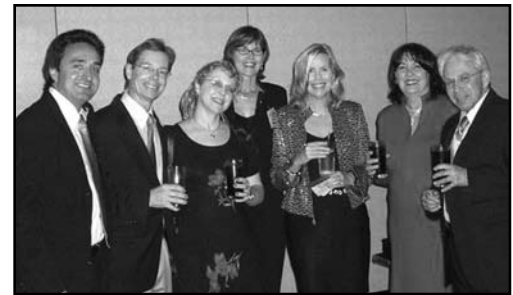
2006 Annual Meeting attendees enjoy the Saturday night festivities